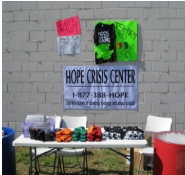
T-Shirts or Koozies anyone?