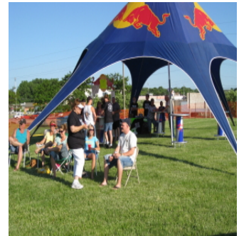
Risky's setup a Red Bull Tent for the event